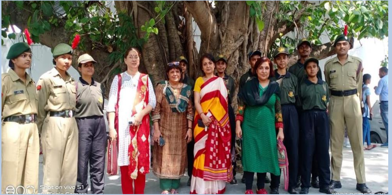
International Environmental Day