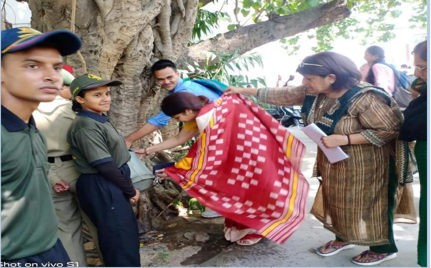
International Environmental Day