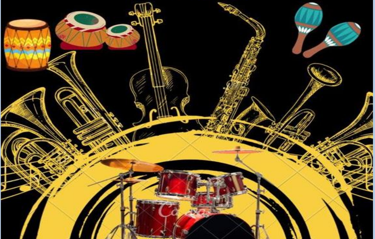
Media: a few clips

MINIMUM FIVE-STUDENT BATCH IS REQUIRED TO START CLASSES IN ANY OF THE INSTRUMENT